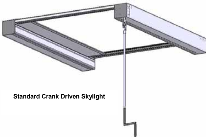
Standard Crank Driven Skylight