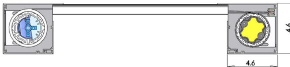
Cross section of Standard Motorized Skylight